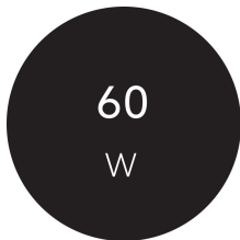
Output power range