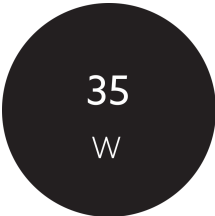
Output power range