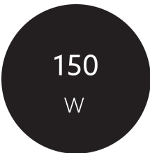
Output power range