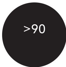
Colour rendering index CRI