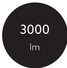
Luminous flux per meter