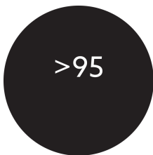
Colour rendering index CRI