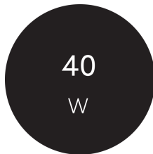
Output power range