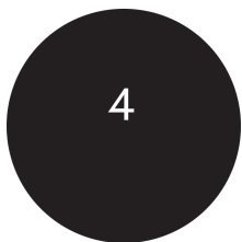
Number of plug-in contacts