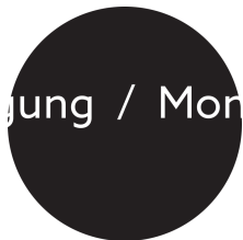
Type of fastening