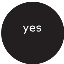
Ball impact resistant