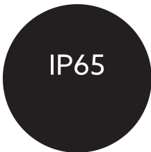
Degree of protection (IP)