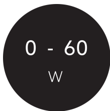
Output power range