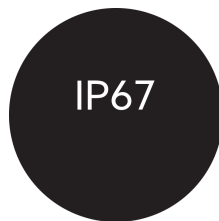
Degree of protection (IP)