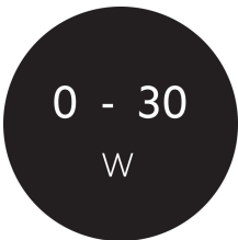
Output power range