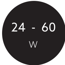
Output power range