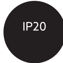
Degree of protection (IP)