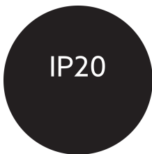
Degree of protection (IP)