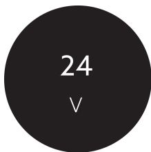
Output voltage range