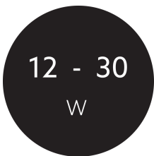
Output power range