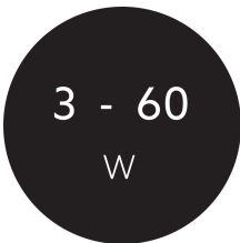
Output power range