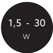
Output power range