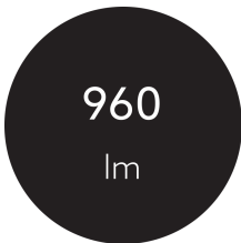
Luminous flux per meter