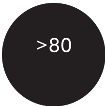
Colour rendering index CRI