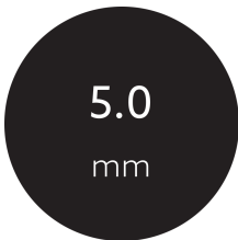
Length of particular segments