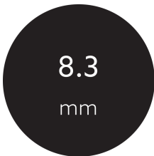
Length of particular segments