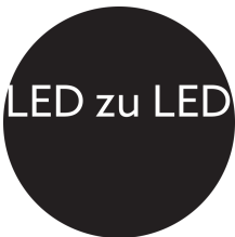
Distance relating to