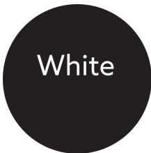
Colour of light