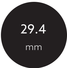
Length of particular segments