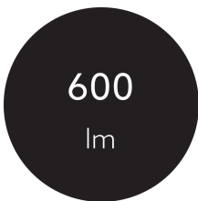
Luminous flux per meter