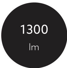
Luminous flux per meter